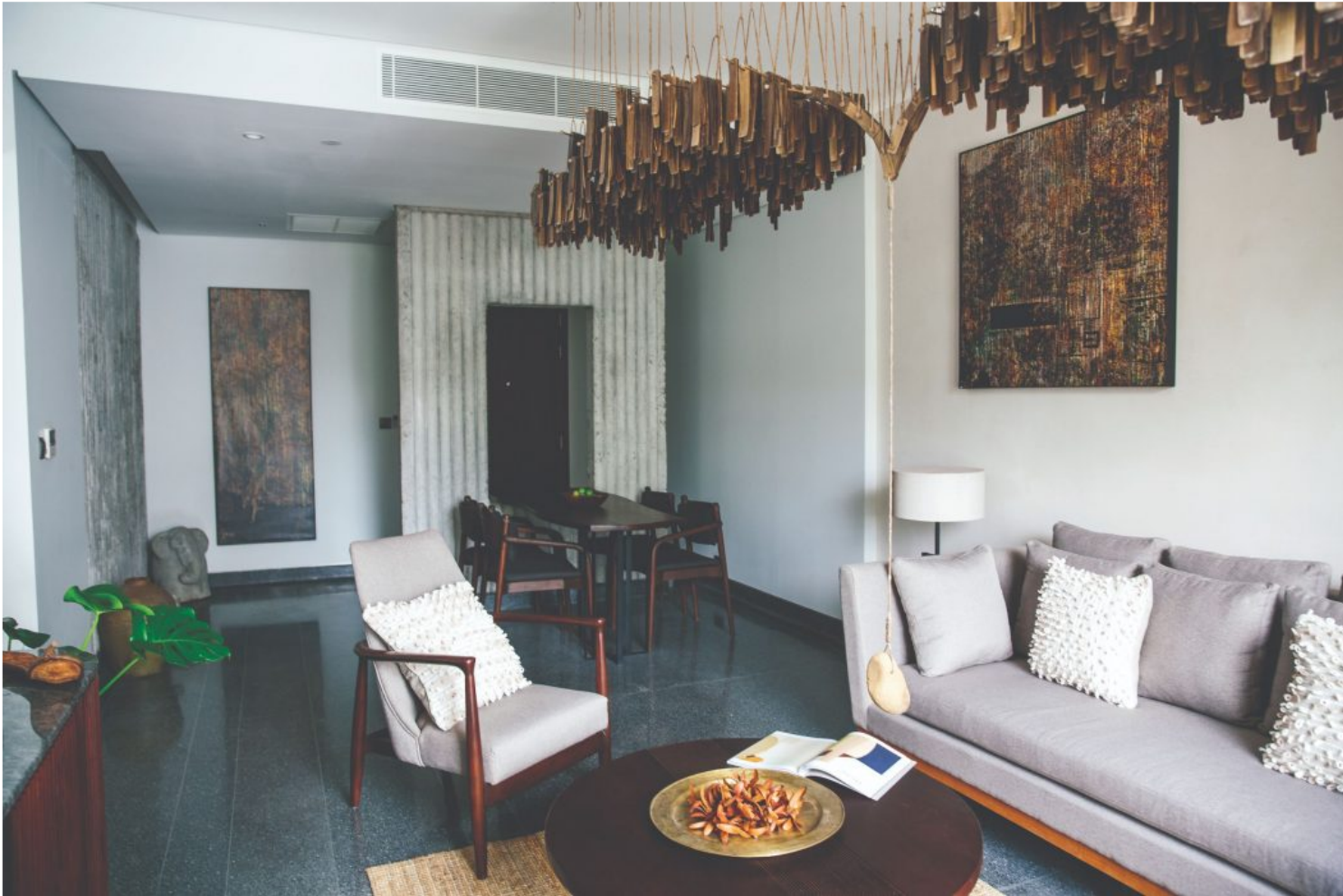
Suite art at Treeline Urban Resort.

With a headliner like Angkor Wat, Siem Reap doesn't have to try hard to keep visitors coming. But, not content to cruise on the UNESCO star's coattails, a clutch of boutique hotels in the city is daring to innovate.