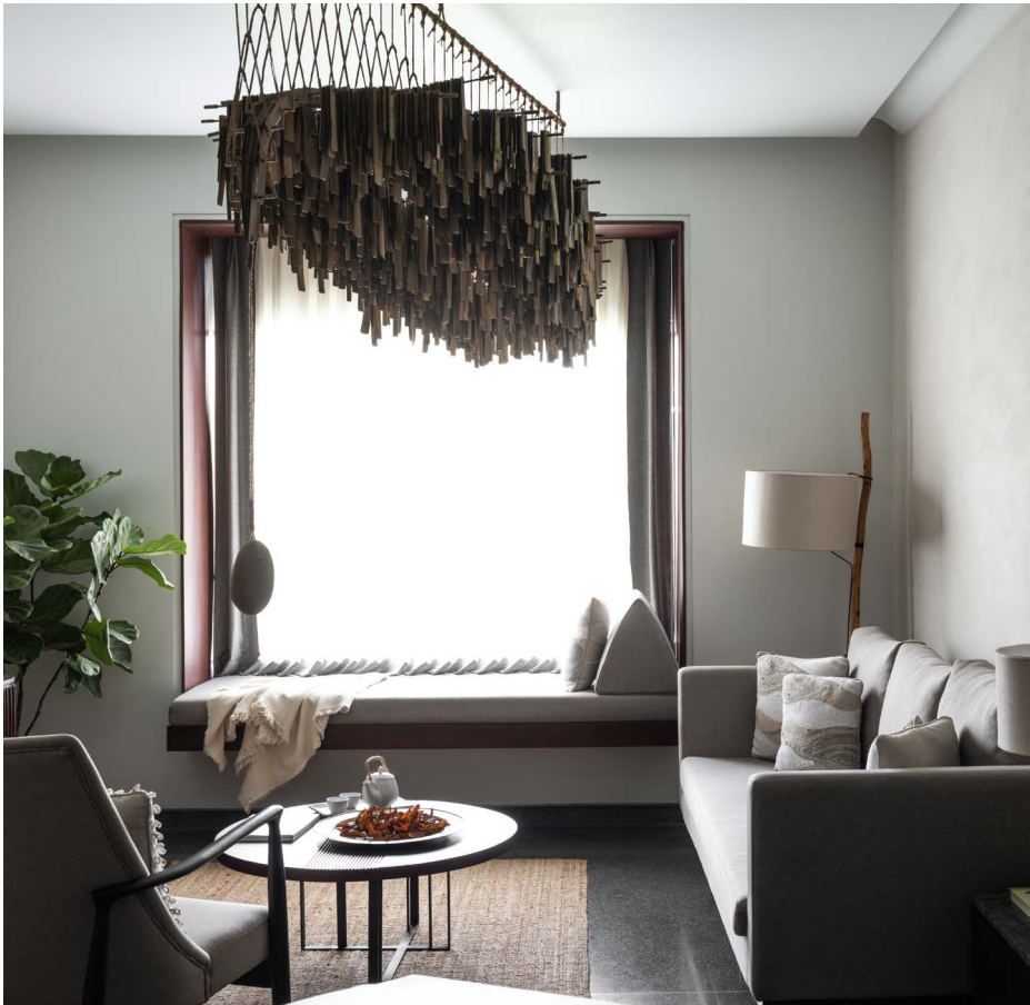
This page Organic installations by artist Sothea Tang adorn each of the guest rooms. Furniture, soft furnishings and design objects are all locally made or sourced, and the hotel avoids single-use plastic